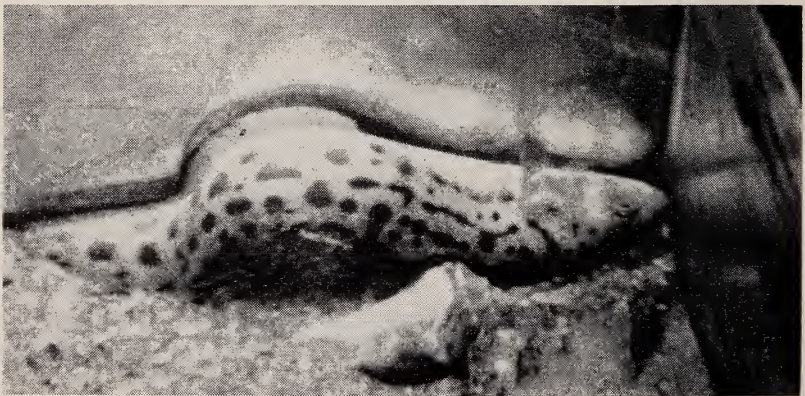
Figure 5. Live specimen in resting position.

O. omostigmum shows a negative phototrophism, moving away from a strong artificial light and also away from a patch of sunlight in the aquarium. The ventral fins are highly movable and apparently have an important tactile and perhaps an olfactory function; they are kept in continuous motion as the fish swims along just off the bottom. Food was not accepted until after it came in contact with these ventral filaments.